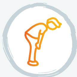
Feeling tired or weak

The most common side effects of MONJUVI include: