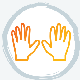
Swelling of lower legs or hands