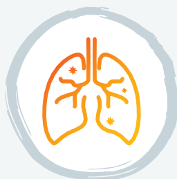
Respiratory tract infection